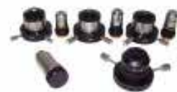
Phase and Dark Field

The LW Scientific I-4 microscope features exceptional optical quality with an infinity optical system, like found on the most expensive laboratory microscopes, but at a fraction of the price. The ergonomic narrow design allows users to rest their arms flat on the table and easily operate all controls. The binocular eyetubes can also be rotated upward to achieve an additional 2 inches of height for taller users. LED lighting produces "daylight" color, with a cool temperature and long life. Comfort, durability, dependability, and superior imaging make the I-4 a great value for labs, physicians, vets, and universities. The I-4 microscope is intended for use as a biological microscope in a professional environment in accordance with the guidelines set forth in this operations manual.